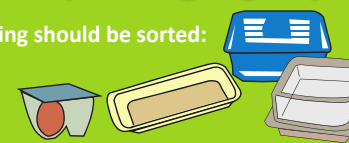
Plastic and polystyrene trays